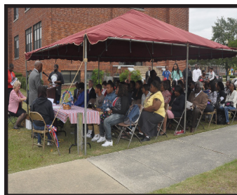
Students, staff, and faculty listen intently to the reading of the Constitution.