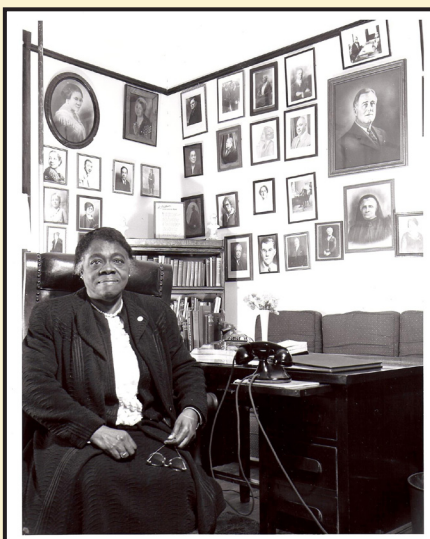
Photo of Mary McLeod Bethune