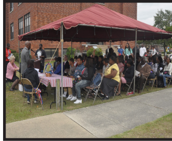
Students, staff, and faculty listen intently to the reading of the Constitution.