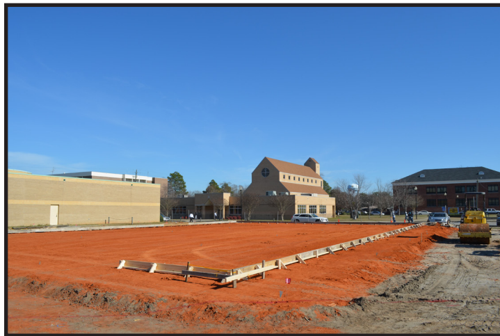
Groundbreaking/Construction site of the new Student Health & Wellness Center